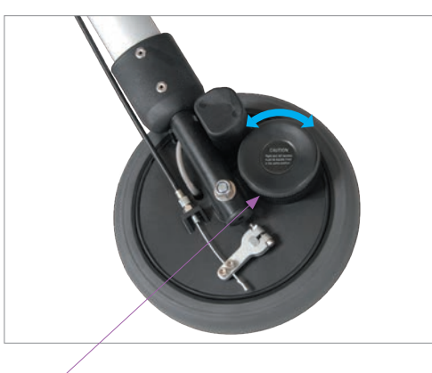
Speed Control Handle